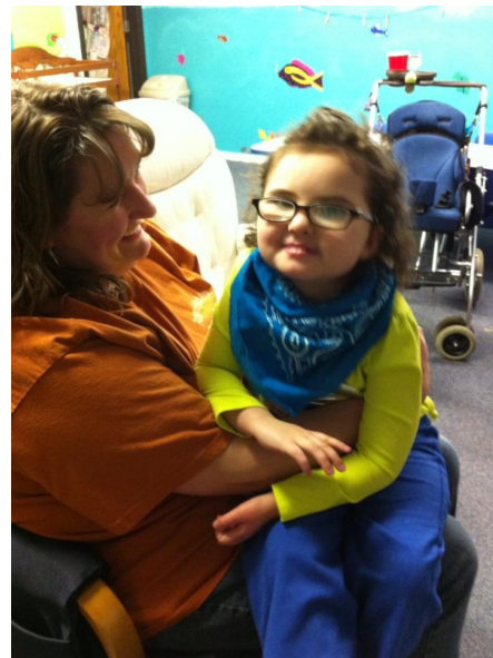
Sooner SUCCESS respite program for children with special needs and their siblings

In many communities there are "gaps" — these are services that are desperately needed, but simply not available. We form community groups and partnerships with providers and families to identify and, whenever possible, create or modify local resources to meet the needs of families in that community. Our goal is to support and build more inclusive communities!